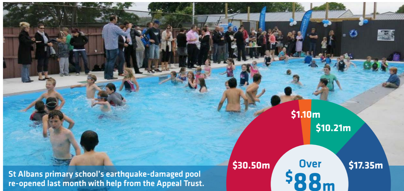
St Albans primary school's earthquake-damaged pool re-opened last month with help from the Appeal Trust.

to the Sea", towards future projects that will strengthen the connection from Te Papa Ōtākaro/ Avon River Precinct at Fitzgerald Avenue through eastern Christchurch all the way to the sea. Projects could include such things as permanently restoring environmental, recreation and sporting features, wetlands, walkways, cycleways, public performance spaces, community spaces and play areas, and we look forward to progressing these in 2014.