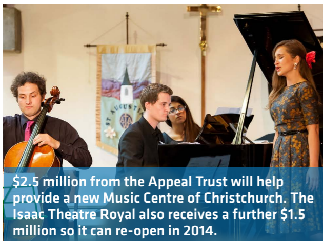
$2.5 million from the Appeal Trust will help provide a new Music Centre of Christchurch. The Isaac Theatre Royal also receives a further $1.5 million so it can re-open in 2014.

Trustees' largest funding decision this year committed $15 million to "Connecting the City