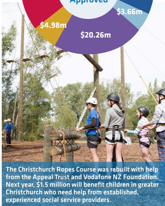
The Christchurch Ropes Course was rebuilt with help from the Appeal Trust and Vodafone NZ Foundation. Next year, $1.5 million will benefit children in greater Christchurch who need help from established, experienced social service providers.